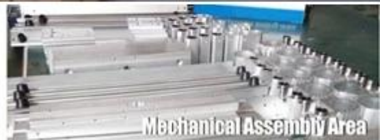
Mechanical Assembly Area