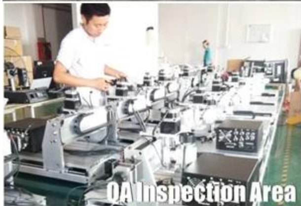
QA Inspection Area