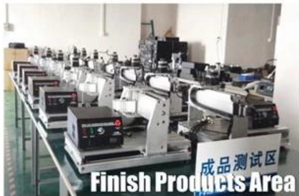
Finish Products Area