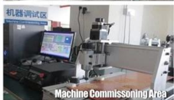
Machine Commissioning Area