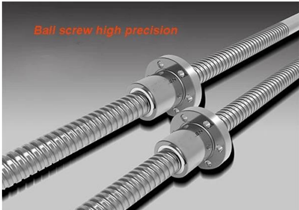
Ball screw high precision