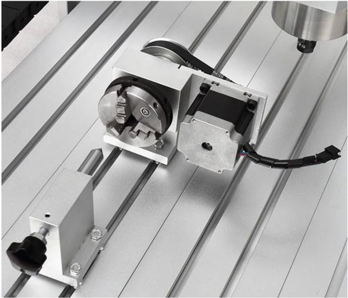
Mach 3 CNC 6090 Router 4 Axis packing