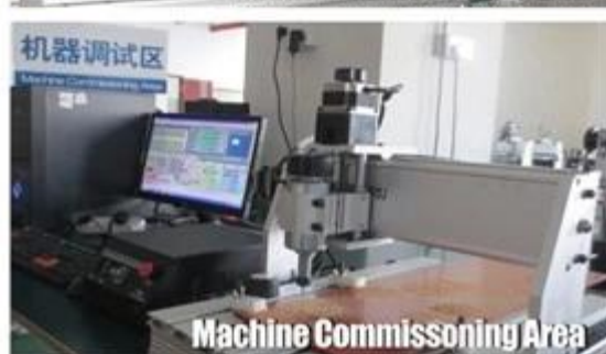
Machine Commissioning Area