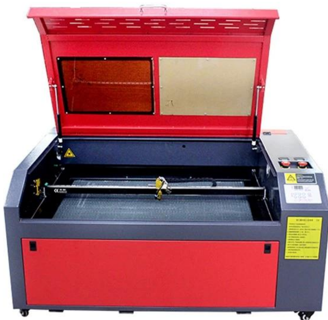
SL-6090 100W CO2 Laser Engraving Machine pictures