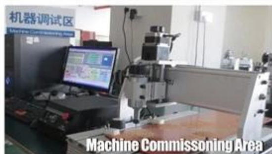
Machine Commissioning Area