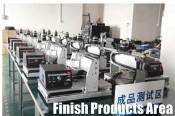
Finish Products Area