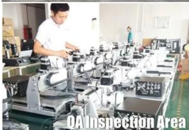
QA Inspection Area