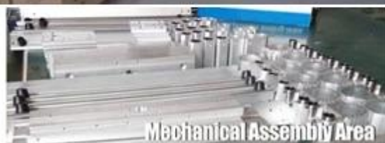
Mechanical Assembly Area