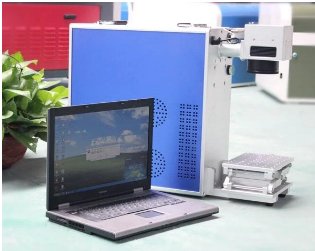
S004 10W/20W Mini Portable Fiber Laser Marking Machine