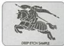
Stainless steel material