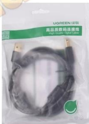
USB 2.0 Line