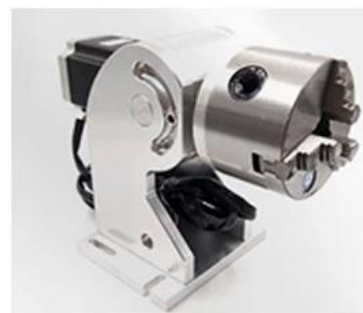
Roatry Axis (optional)