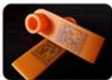
Animal Ear Tag