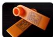
Animal Ear Tag