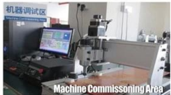
Machine Commissioning Area