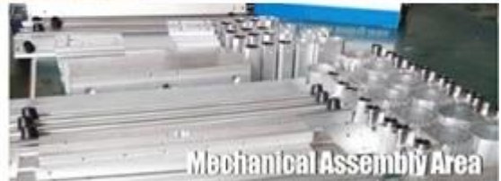
Mechanical Assembly Area