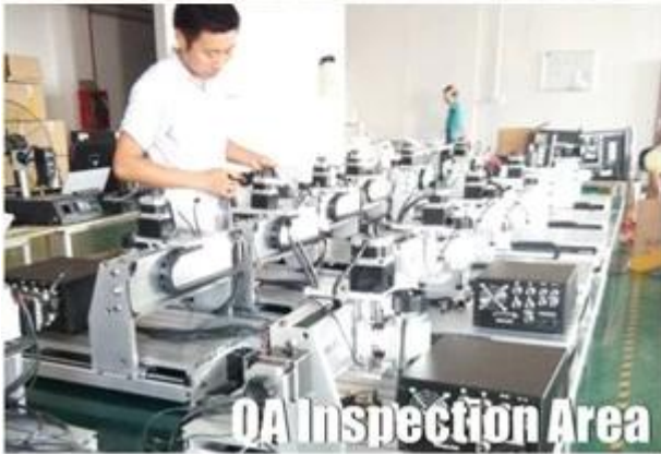
QA Inspection Area