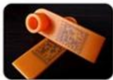
Animal Ear Tag