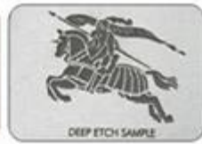
Stainless steel material