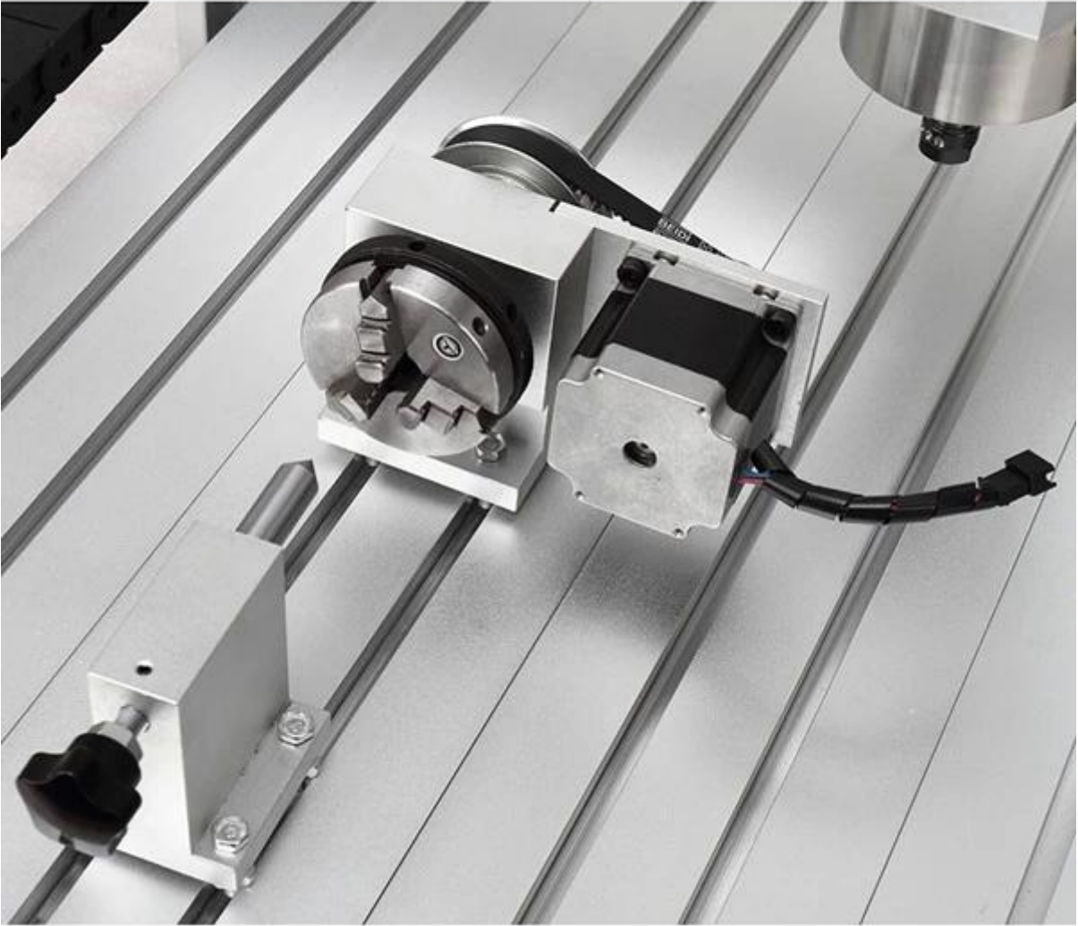
6090 CNC Router 4 axis packing