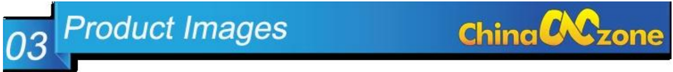
SL-6090 100W CO2 Laser Engraving Machine pictures