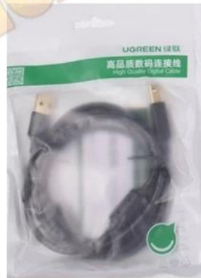
USB 2.0 Line