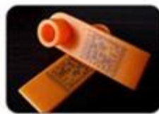
Animal Ear Tag