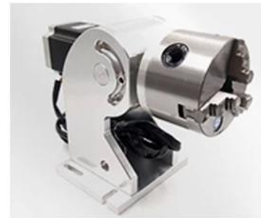
Rotary Axis (optional)