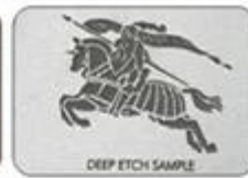
Stainless steel material