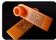
Animal Ear Tag